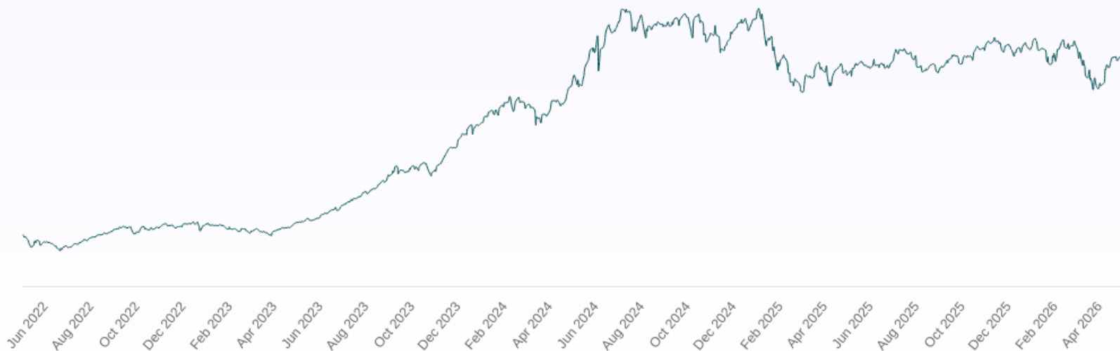
○ Wright New India Manufacturing Theme

Note: Live performance includes rebalances. It is a tool to communicate factual return information and should not be seen as advertisement or promotion.