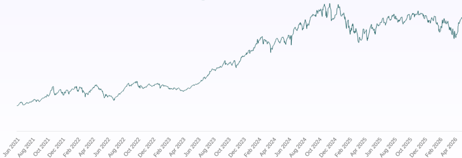
Wright Momentum Model

Note: Live performance includes rebalances. It is a tool to communicate factual return information and should not be seen as advertisement or promotion.