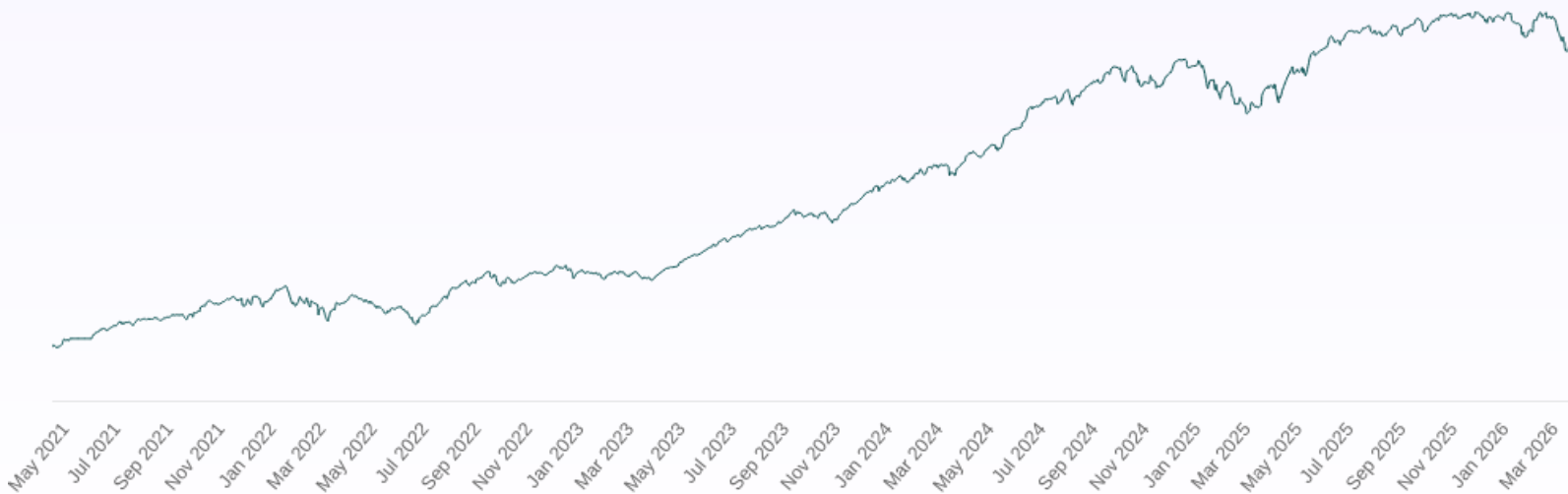
Mutual Funds - Moderately Conservative

Note: Live performance includes rebalances. It is a tool to communicate factual return information and should not be seen as advertisement or promotion.