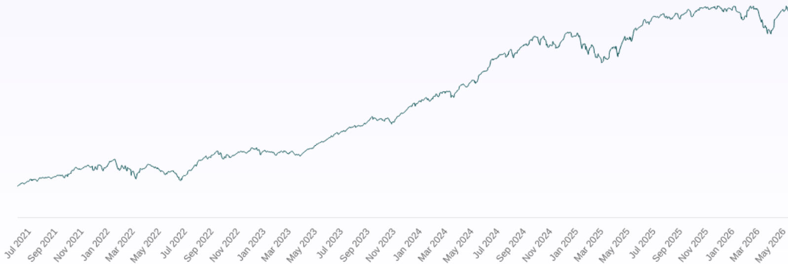
Mutual Funds - Moderately Conservative

Note: Live performance includes rebalances. It is a tool to communicate factual return information and should not be seen as advertisement or promotion.