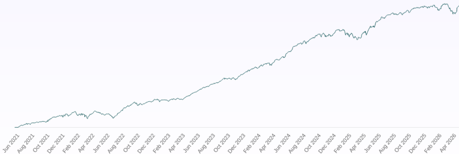
Mutual Funds - Conservative

Note: Live performance includes rebalances. It is a tool to communicate factual return information and should not be seen as advertisement or promotion.