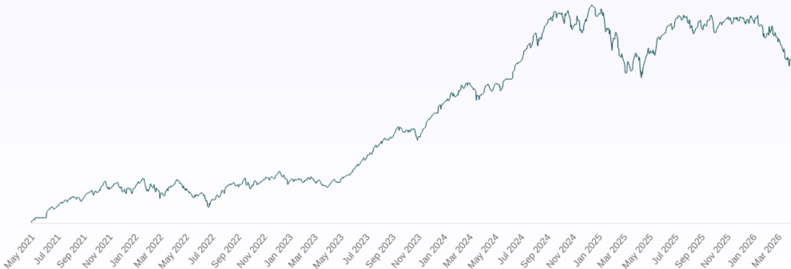
Mutual Funds - Aggressive

Note: Live performance includes rebalances. It is a tool to communicate factual return information and should not be seen as advertisement or promotion.